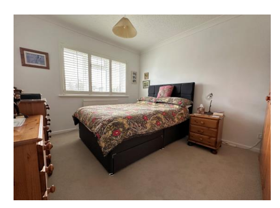
Bedroom Three:-11' 0'' x 8' 3'' (3.35m x 2.51m)

UPVC double glazed window to rear elevation overlooking the garden with fitted shutter blinds, radiator and coving to textured ceiling.