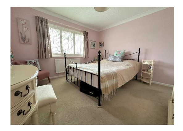
Bedroom Two:- 11' 8'' x 9' 10'' (3.55m x 2.99m)

92 West Street Portchester Hampshire PO16 9UQ Tel: 02392 327 070 | E: portchester@fenwicks-estates.co.uk www.fenwicks-estates.co.uk