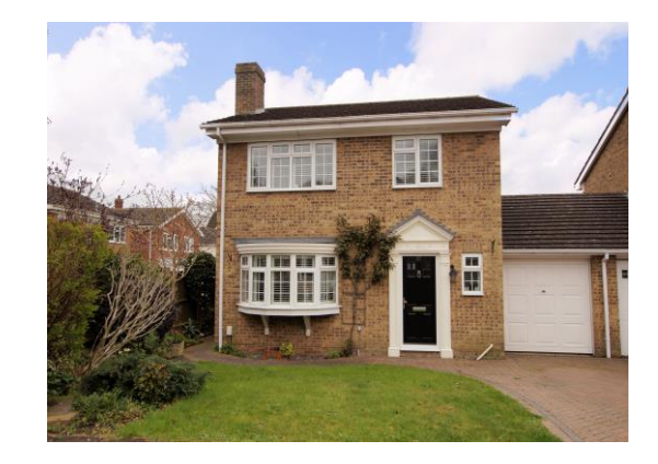
Garage/Workshop:-16' 7'' x 8' 1'' (5.05m x 2.46m)

Front garden laid to lawn with shrubs to border and wooden gate gives pedestrian access to rear garden. Block paved off street parking leads to: