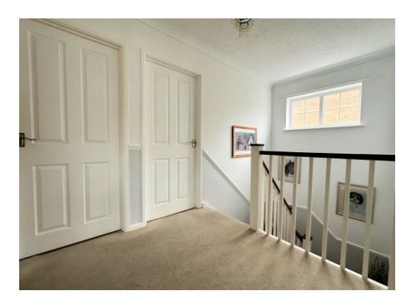
Bedroom One:- 11' 8'' x 11' 1'' (3.55m x 3.38m)

Opaque UPVC double glazed window to side elevation, built-in airing cupboard, dado rail, radiator, access to loft via fitted ladder and coving to textured ceiling. Doors to: